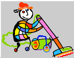
Friday, January 29th Closed for Cleaning Day